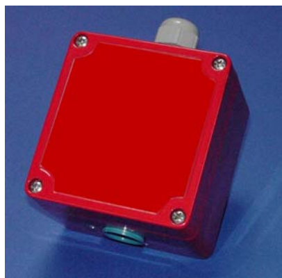
Figure 3. Gas Measuring System

SureCell sensor with 4-20mA transmitter and installation kit, provided as a complete unit, fitted into aluminium housing.