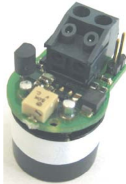
Figure 1. NO 2 sensor with 4-20 mA transmitter