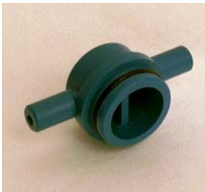
Figure 5. Test gas cap Part no. 2112B1010

Two wire screw terminal: The transmitter has a two wire screw terminal to connect a 24V d.c. power supply. There is no polarity requirement across the two screw terminals (i.e. there is no +/- logic).